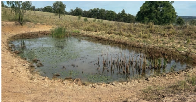
image above: A dam with reduced water levels showing an increase in sediment and algae. Note this is not Blue-green Algae

Due to dramatic changes to the weather over the summer. I think it is timely for landholders of urban and rural properties to be aware of water quality and quantity issues for their animals. Property owners need to adapt and increase their monitor water supplies Water supply monitoring for animals needs to be more frequent in hot and dry conditions. As the pasture dries out, stock will have less opportunity to obtain moisture through grazing. The quantity of water required by animals does significantly increase in heatwaves, hot and dry conditions. Landholders should check the amount of drinking water required for their stock species, number of animals, aged groups, size of the animals and if they are lactating. Evaporation in dams can be approximately 10mm per day in windy and hot conditions.